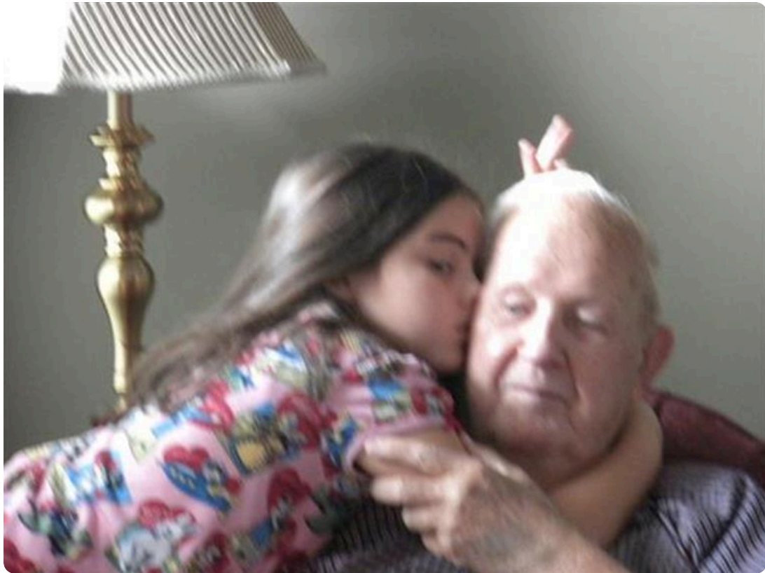
Sophia love Pop Pop